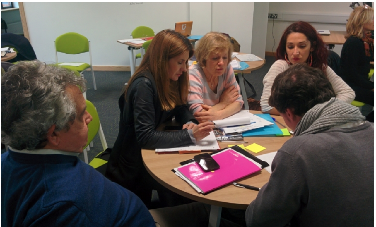
Capacity-building seminar in Shrewsbury, University of Chester