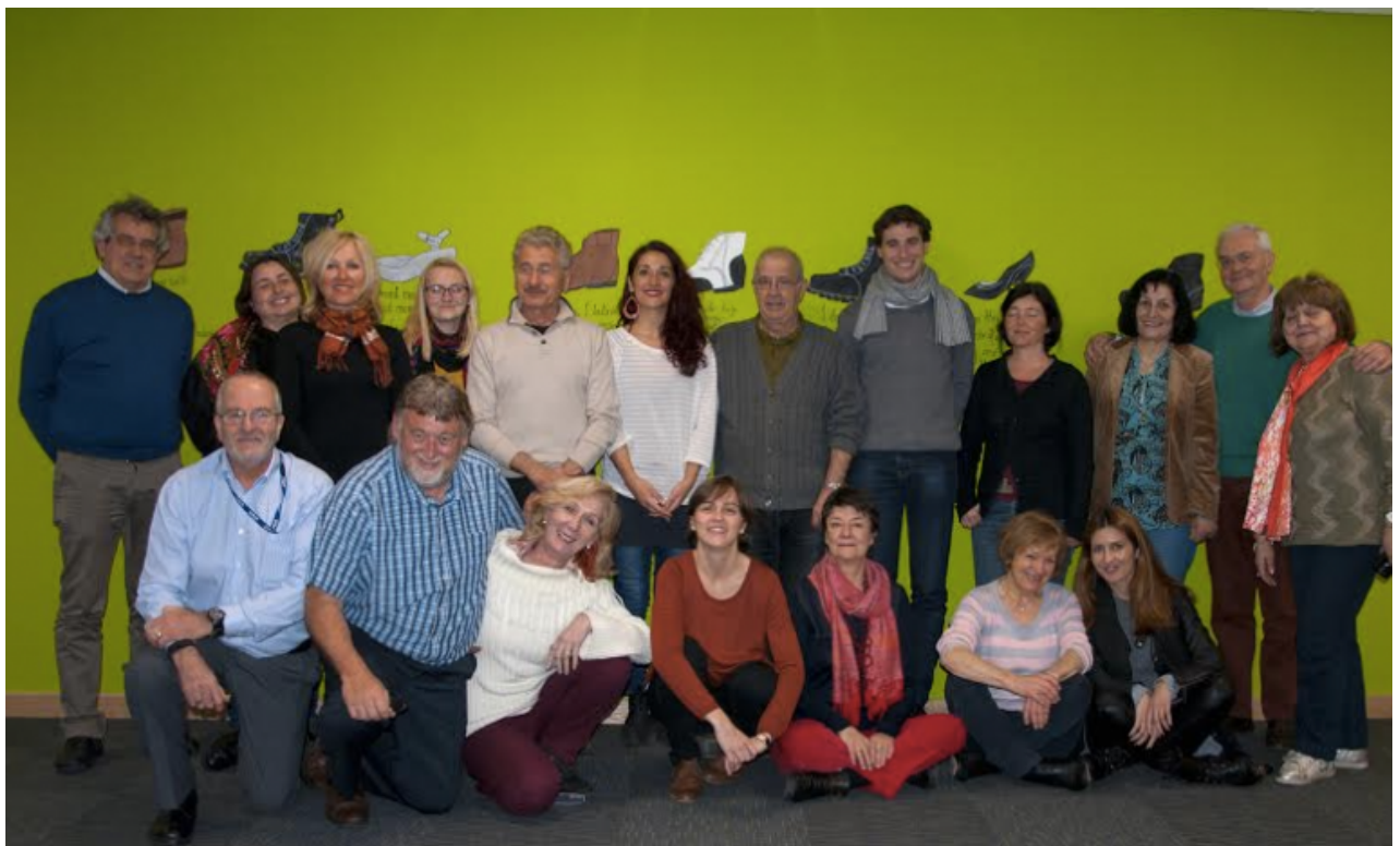
Project participants in the capacity-building seminar