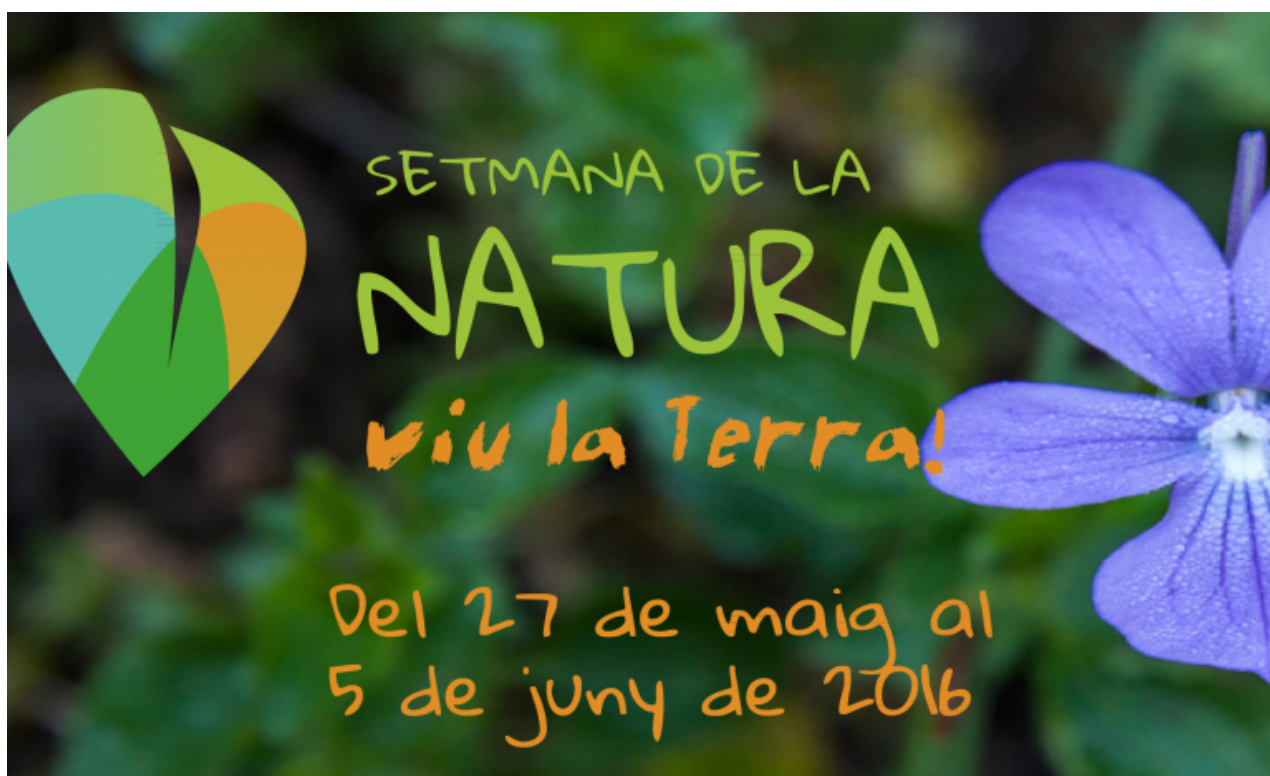
Nature Week in Catalonia: Setmana de la Natura.

From 30 th May to 5 th June 2016 Europeans can give visibility to the real activities, projects and events that are leading Europe towards sustainable development and are helping to achieve the United Nations Sustainable Development Goals.