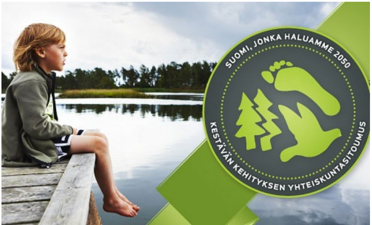
ESDW in Finland: Kestävän kehityksen viikko .