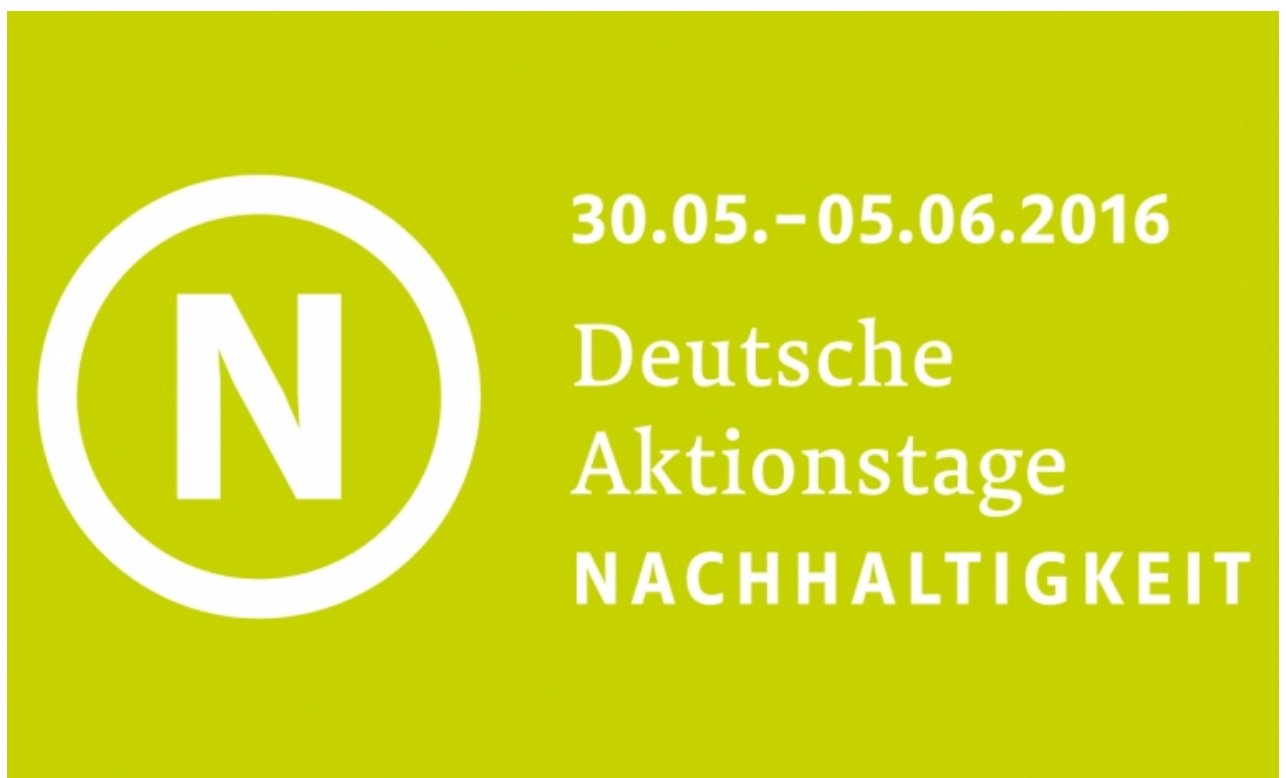
Deutsche Aktionstage Nachhaltigkeit 2016 logo.