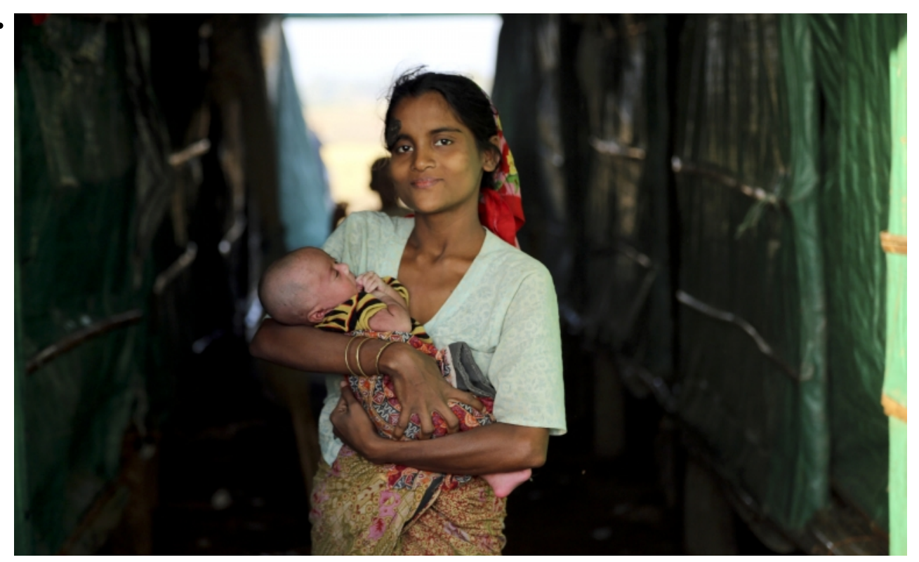
A mother and child at Thea Chaung camp on the outskirts of Sittwe, Rakhine State (Myanmar) / Photograph: UN Photo/David Ohana, Flickr.

The figure of displaced people is now more than 60 million. Syria, Afghanistan or Somalia are some of the countries these people are fleeing. We will examine this humanitarian crisis to try to understand what is happening.