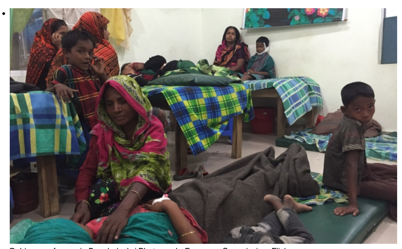
Rohingya refugees in Bangladesh