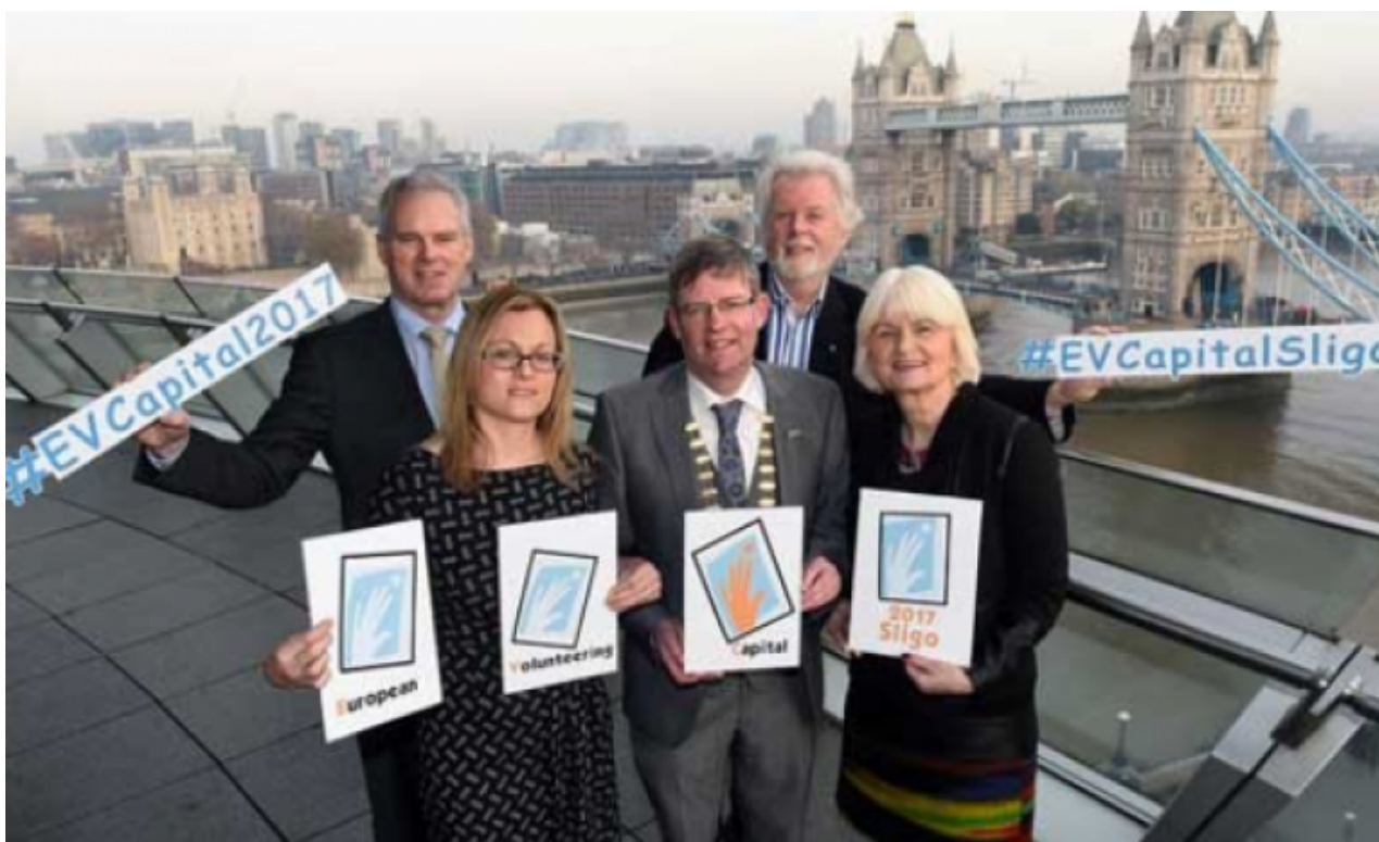
Representatives from the Sligo 2017 candidature celebrating the nomination