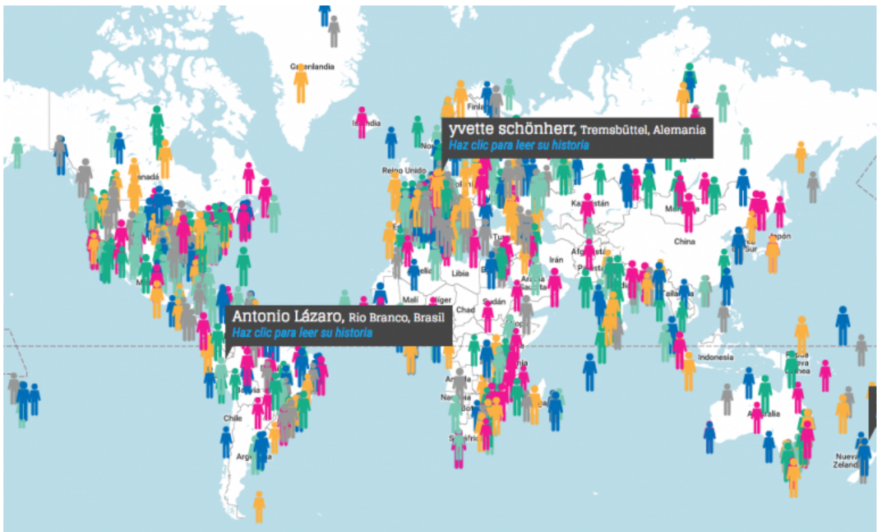
Opportunities on avaaz.org / Image: avaaz.org .