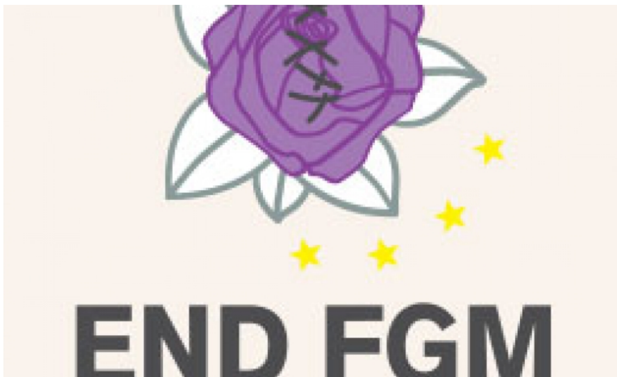
End FGM Logo.