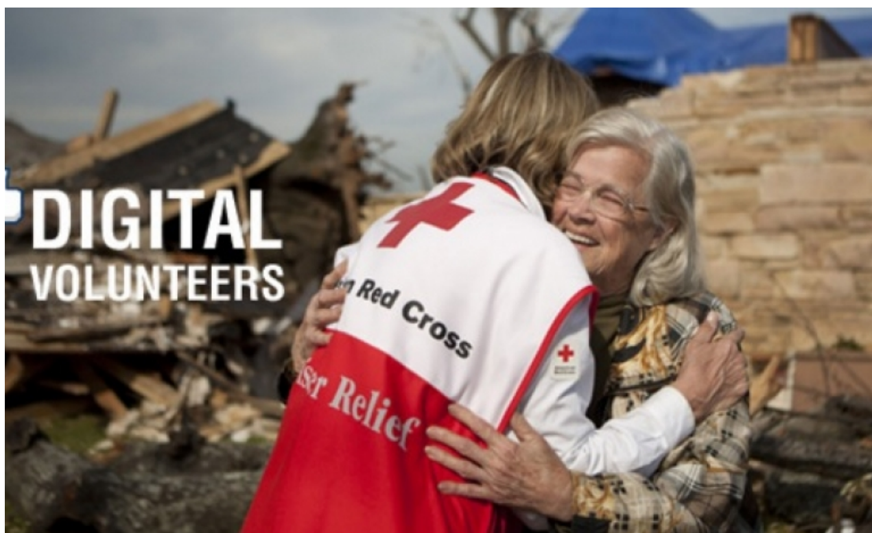
Digital Volunteers at American Red Cross.