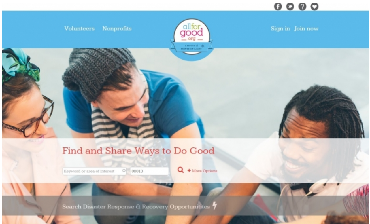
Homepage from Allforgood.

Online volunteering puts NGOs and communities in contact to carry out tasks thanks to one vital tool: an internet connection.