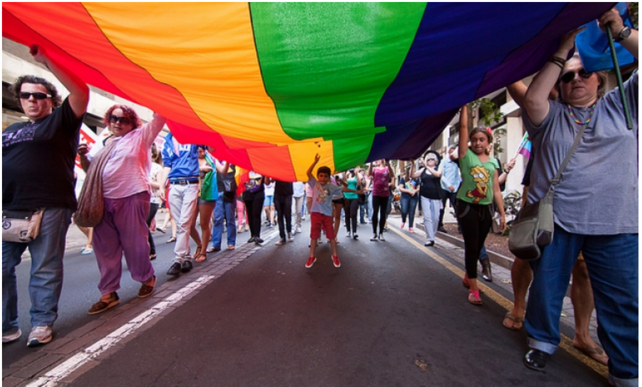
Demonstration against violation of LGBTI rights.

There are many different organisations around the world standing for human rights and fighting to recognise the LGBTI community.