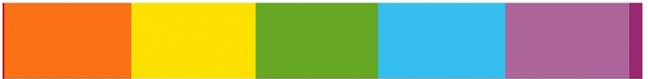
IGLYO Logo.