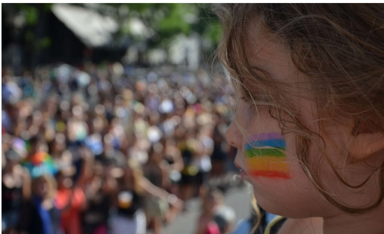
Child in a demonstration in favour of LGBTI community rights.