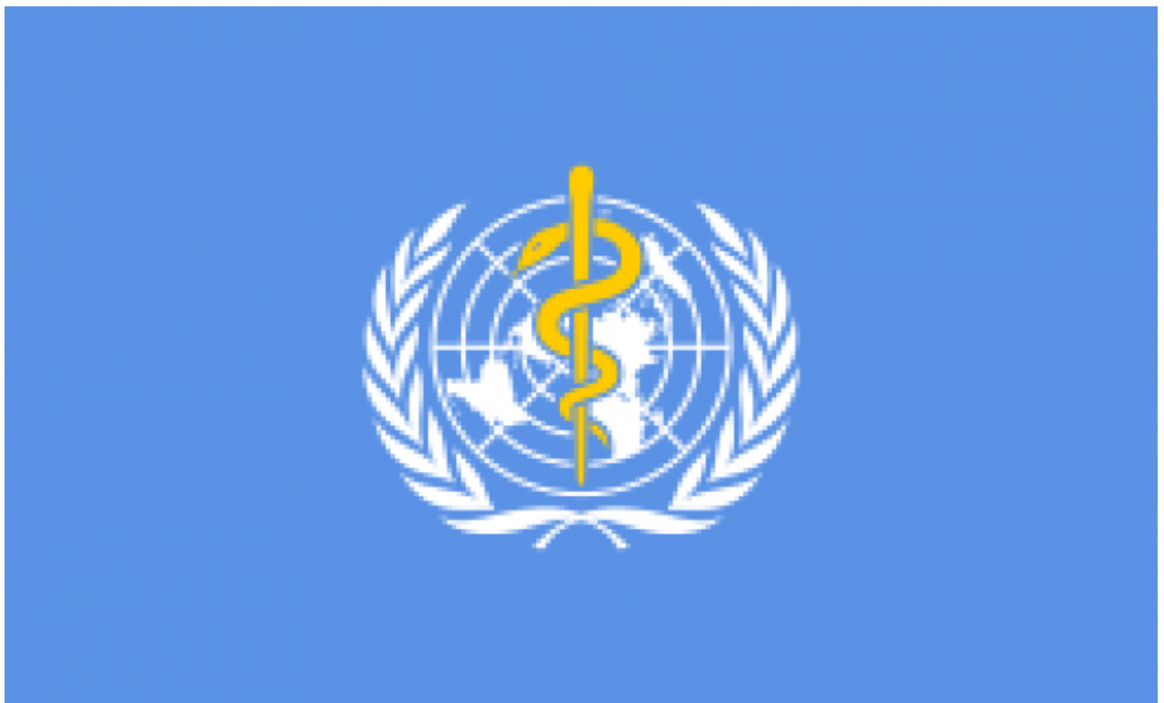
WHO Logo.

During the World Blood Donor Day, the World Health Organization will highlight blood donors' dedication to help those who have suffered any natural disaster, accident, or armed conflict.