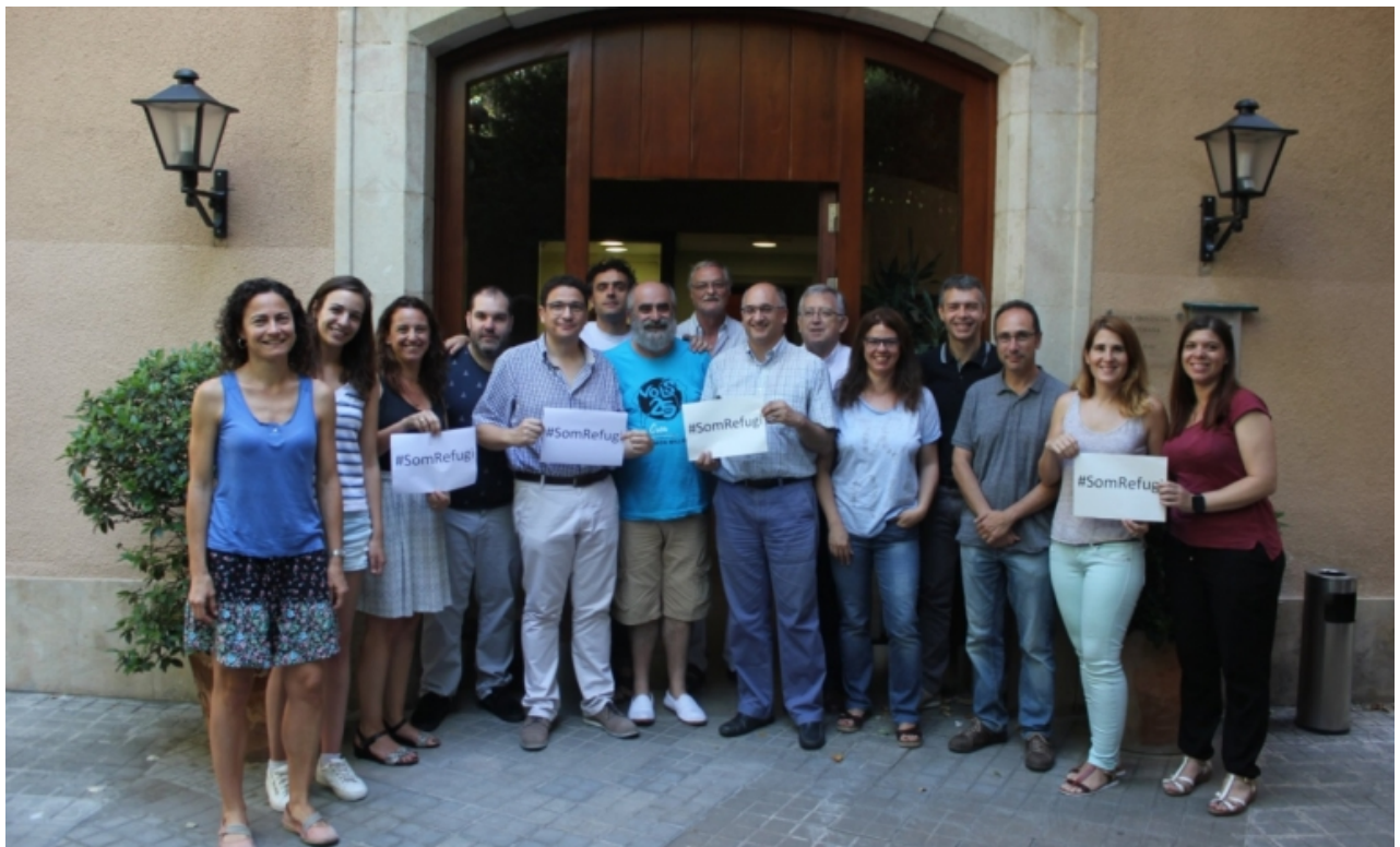
Teamwork of the Salesian presence in Catalonia where the Vols office is.

The NGO Vols is a volunteering association for cooperation and solidarity with children and youth in developing countries. Their working scope is mainly education.