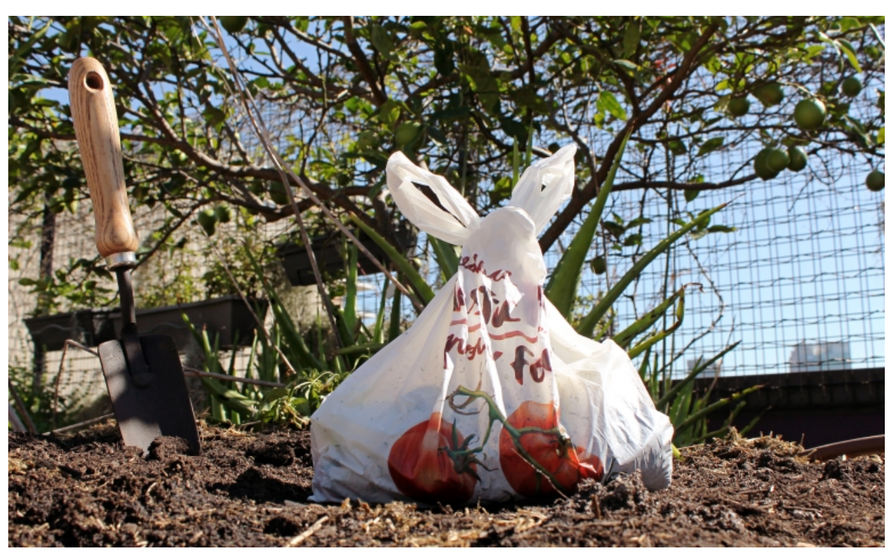
Food grows after the seed is planted.