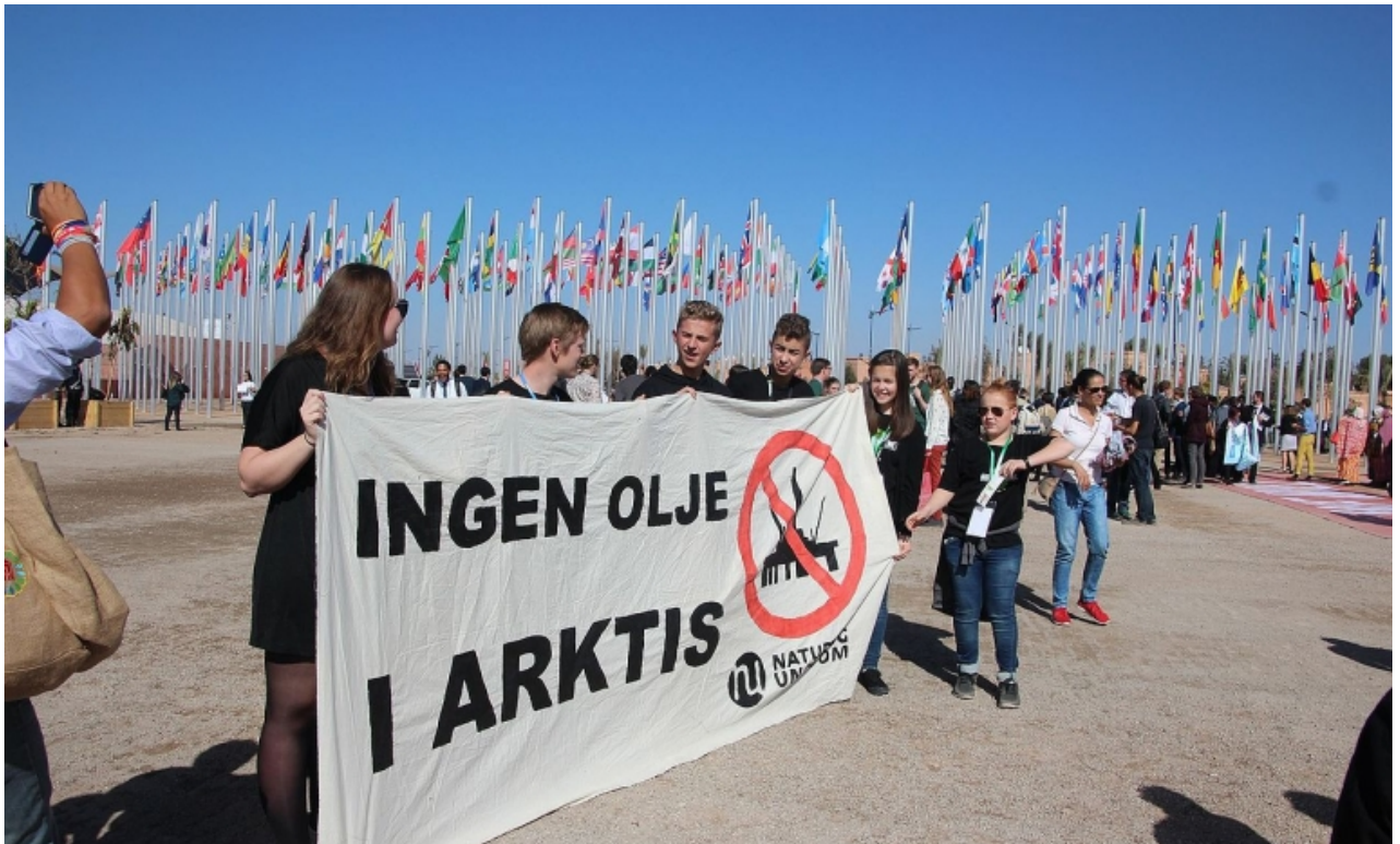
Greenpeace protest against oil drilling.