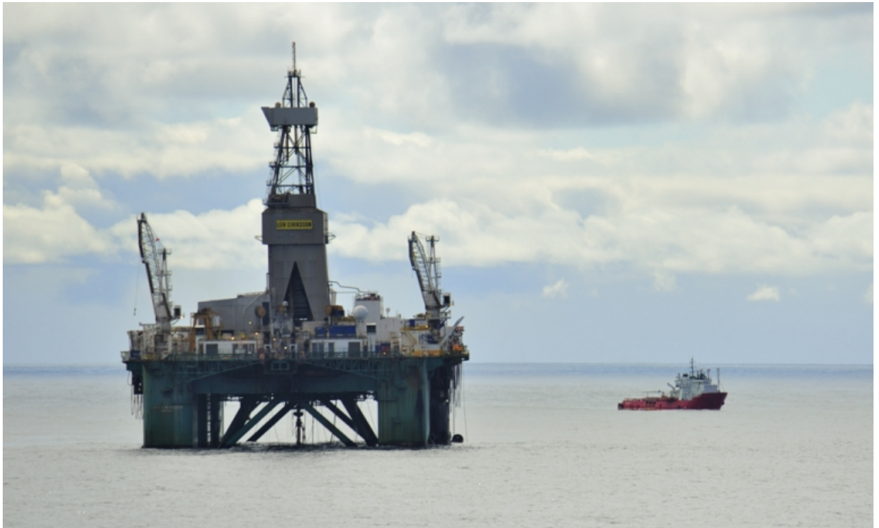
Oil drilling in the Barents Sea.