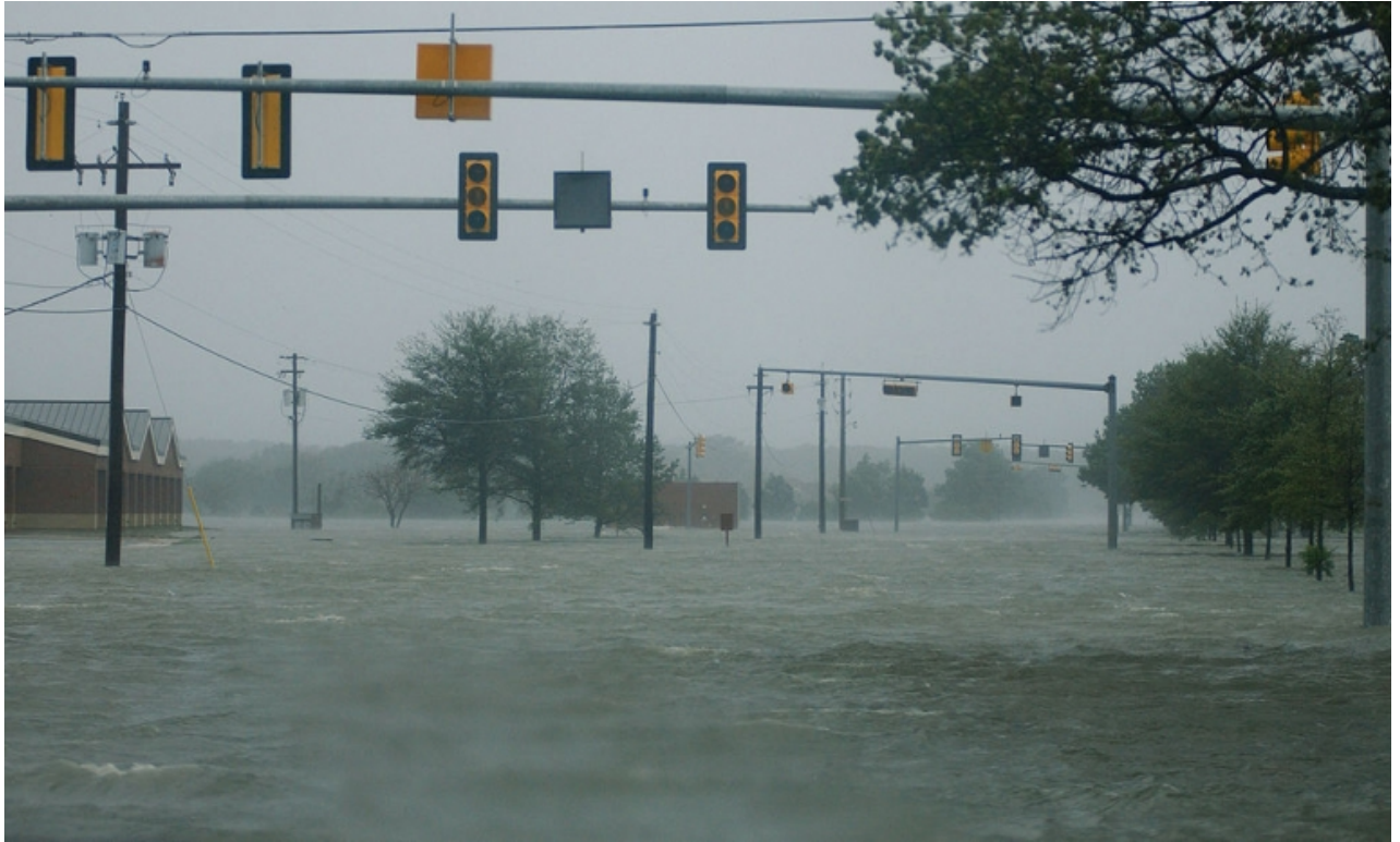
Hurricane consequences.