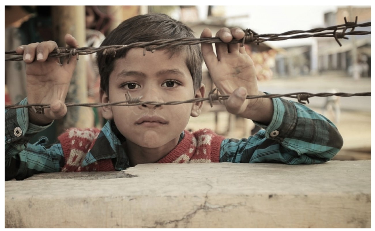
Millions of children and families have been affected in India, Nepal and Bangladesh.

Logo of Coordinadora of NGOs from Spain. Image: Coordinadora.