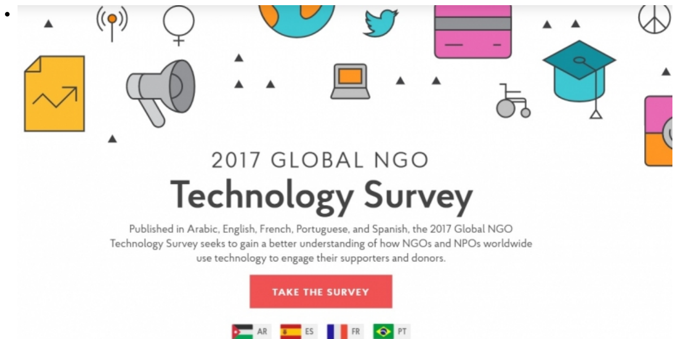
Image from the 2017 Global NGO Technology Survey.