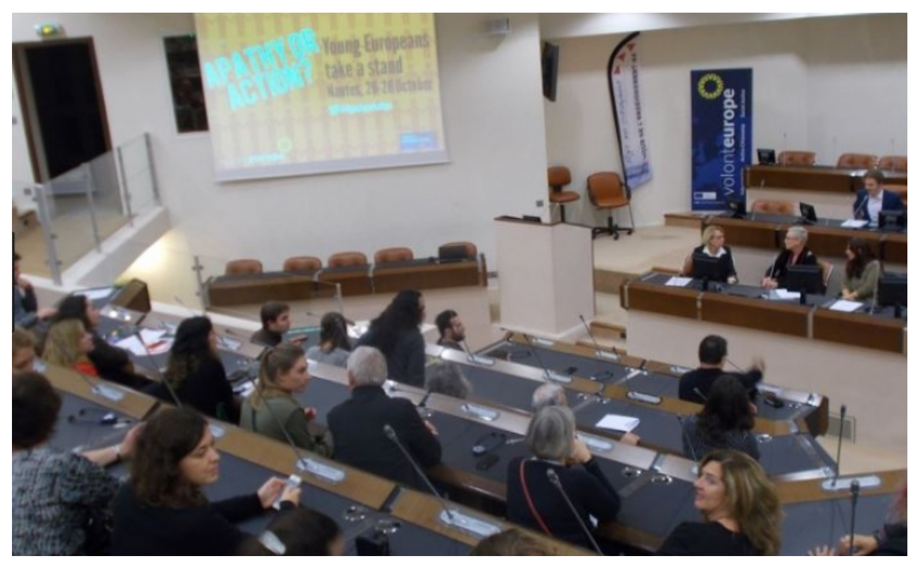
The 25th Annual Conference was celebrated in Nantes.

This is the title of the Volonteurope's 26th Annual Conference which will take place in Brussels on 30-31 October.