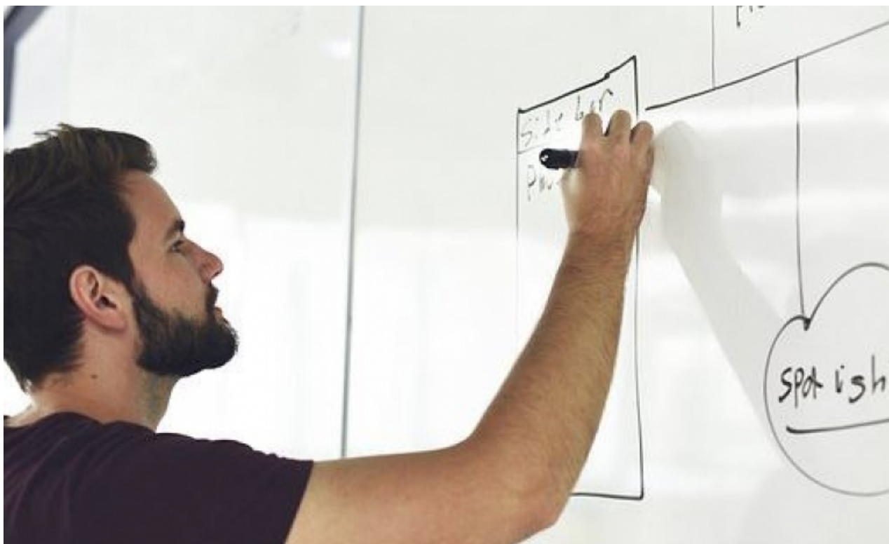
Ensure the participation of the people involved and other actors

Which are the key points an organization should pay special attention to in this process? We present a series of recommendations to improve the quality of assessments and avoid the most common mistakes.