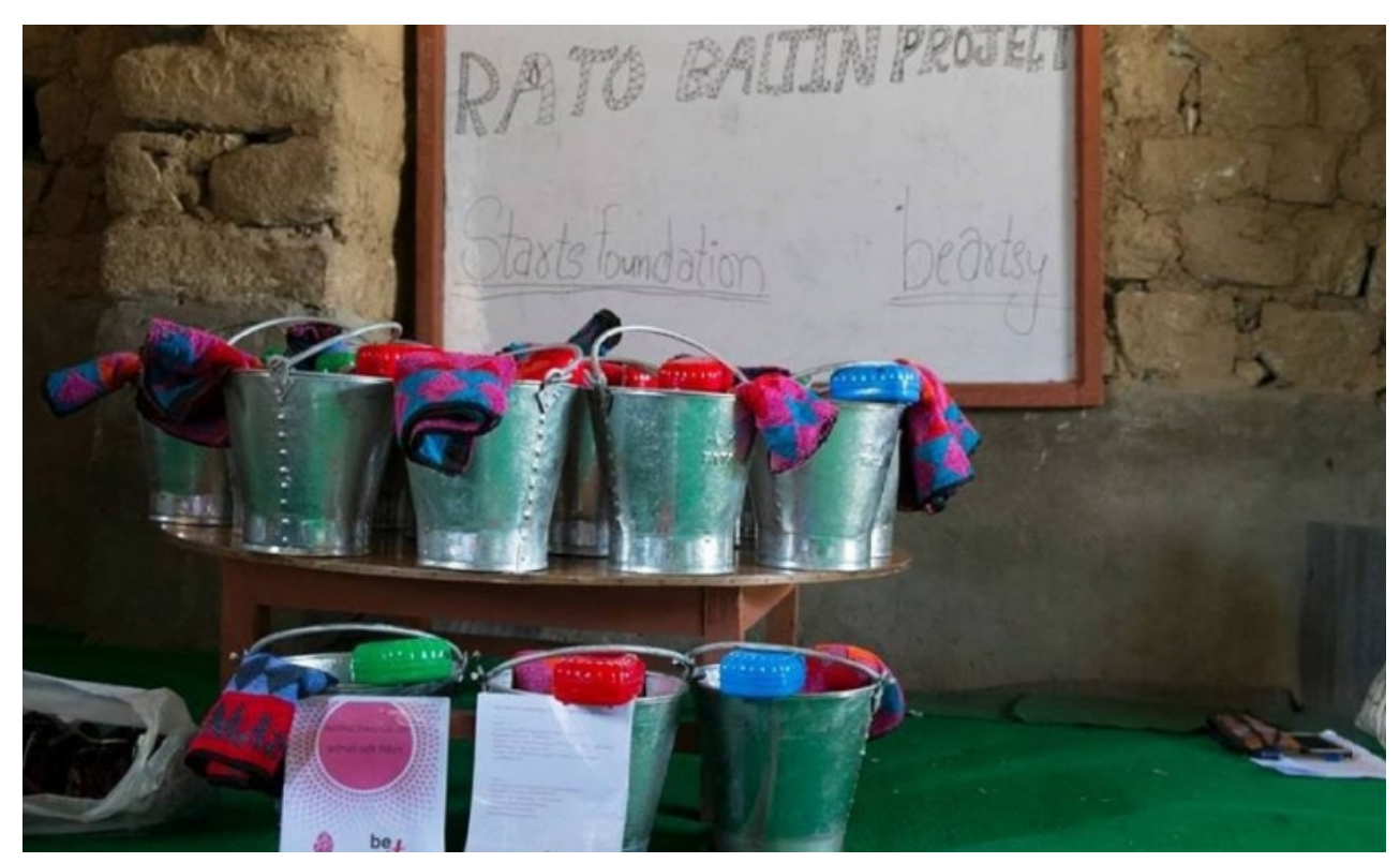
Rato Baltin project