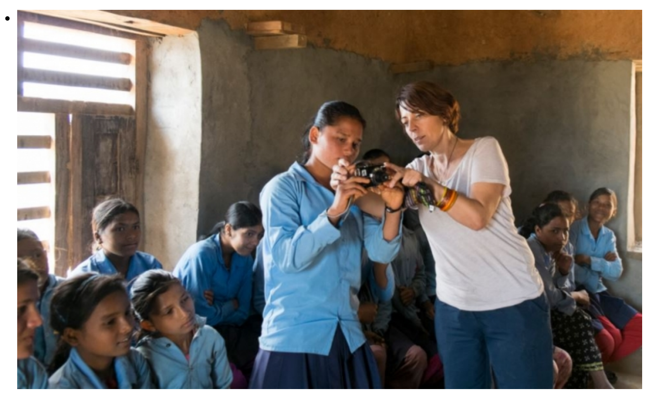
Clara Garcia, Creative Photo Project - Font: Beartsy.org.