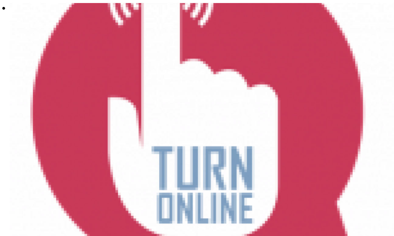
TURN ONline logo.