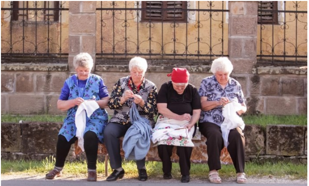
Mayto Designs workers. A project funded by NESsT.