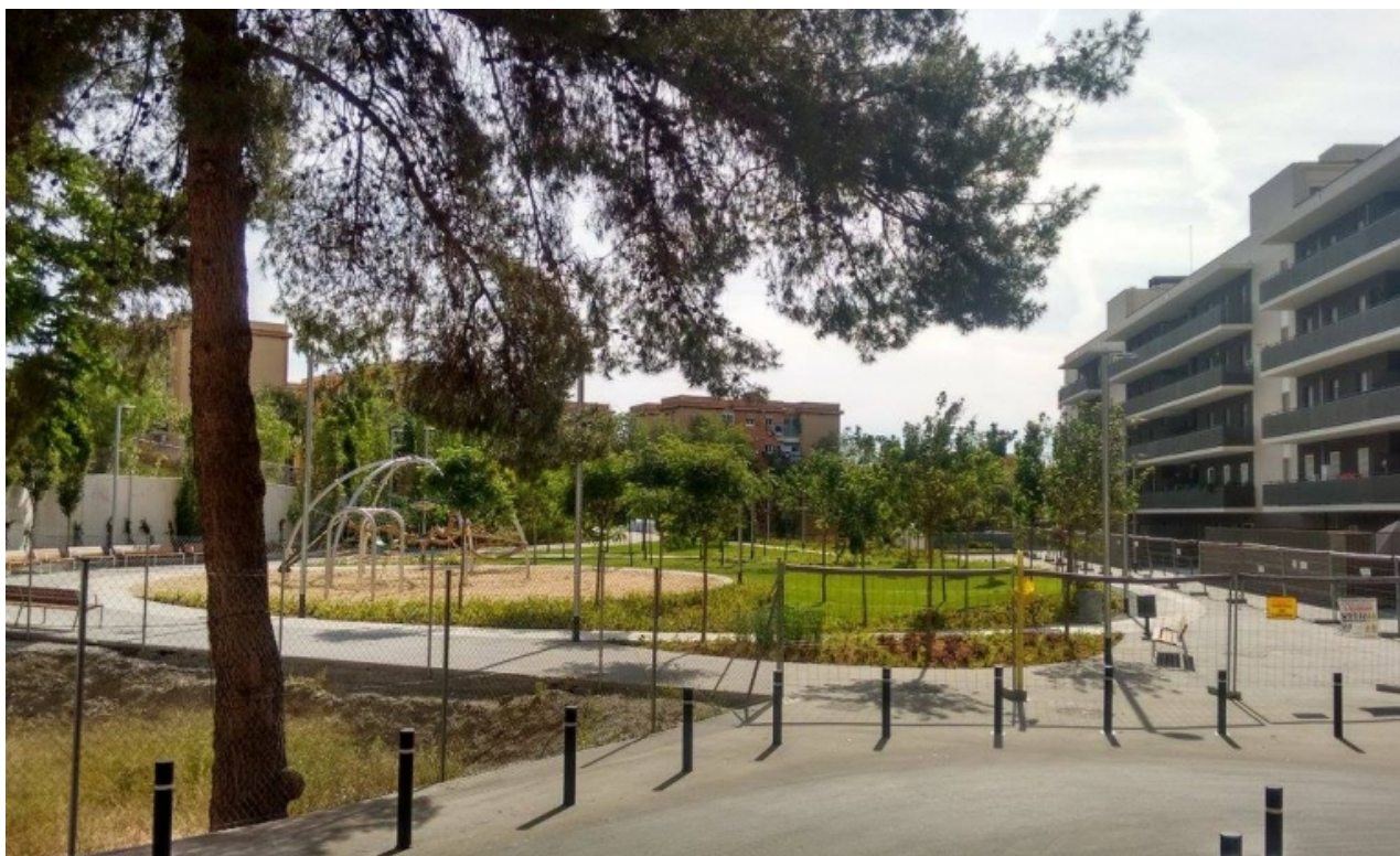
Cirerers florits, a cooperative social housing in Cardedeu by Sostre Cívic.