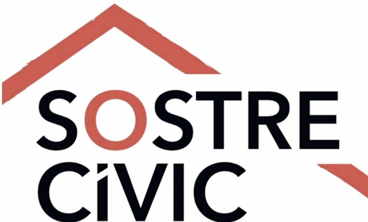
Sostre Cívic's logo.