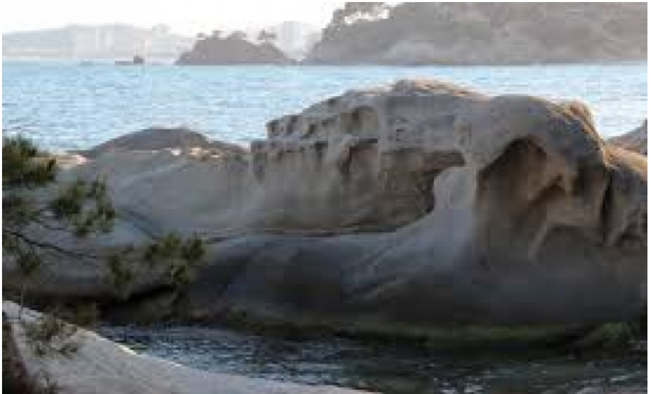
Sant Antoni de Calonge beach, Wikimedia.

Housing is increasingly becoming a huge problem for big cities and urban areas in general. In this sense, Barcelona is no exception to this rule and, even if it is in a much subtler way, neither is Catalonia as a whole.