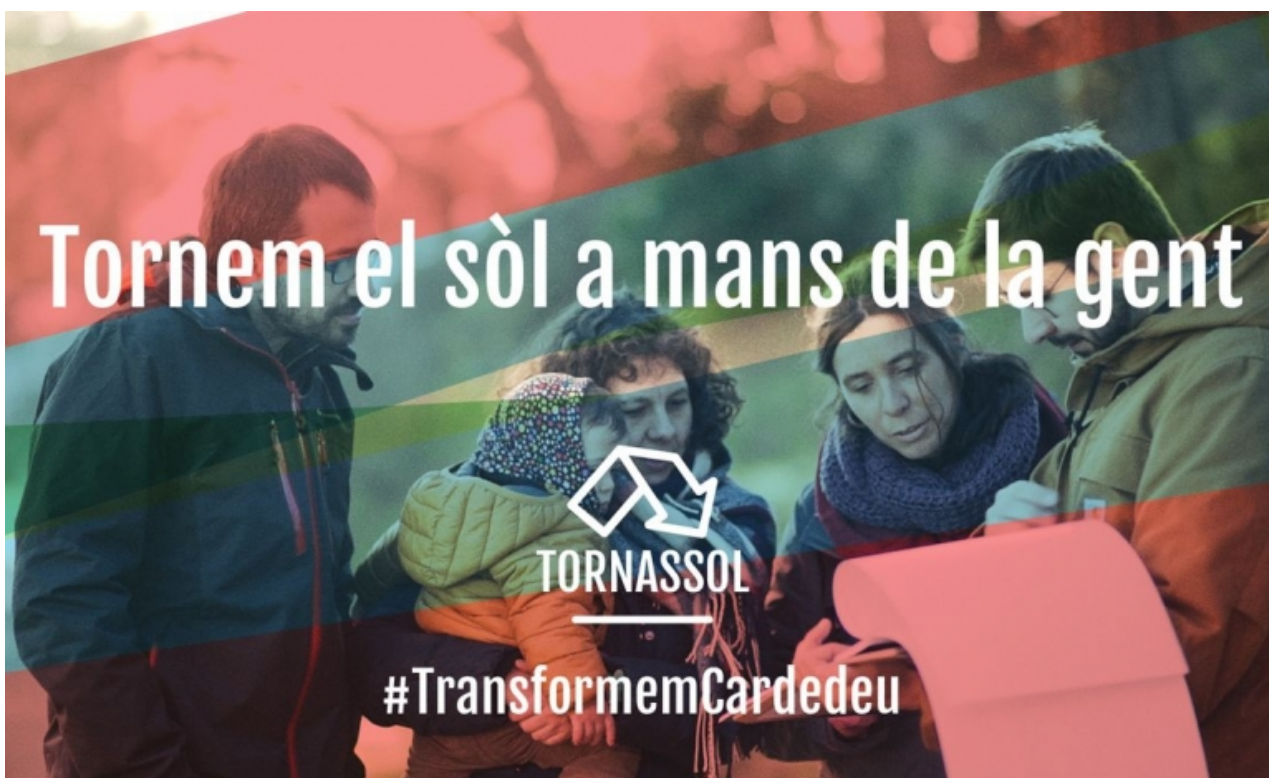
Tornassol, the project to launch La Serreta.