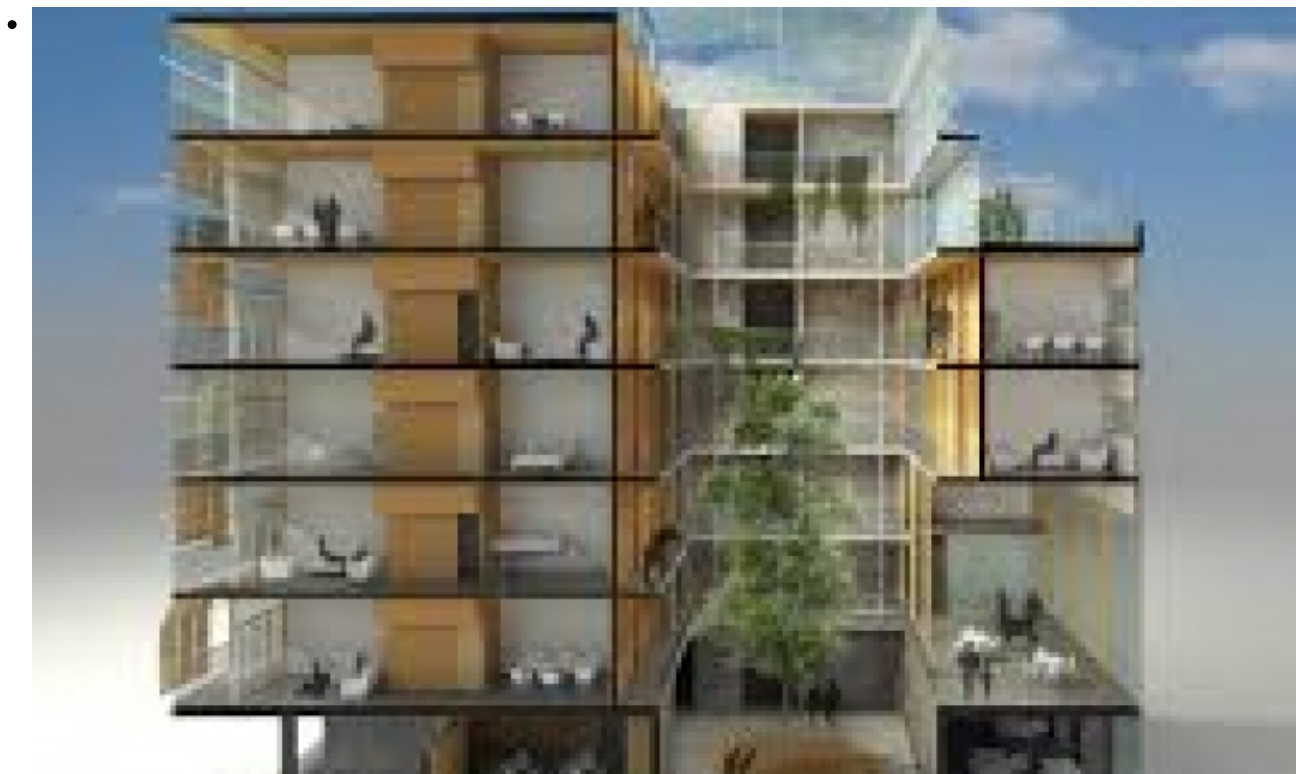
La Borda cooperative social housing in Barcelona.