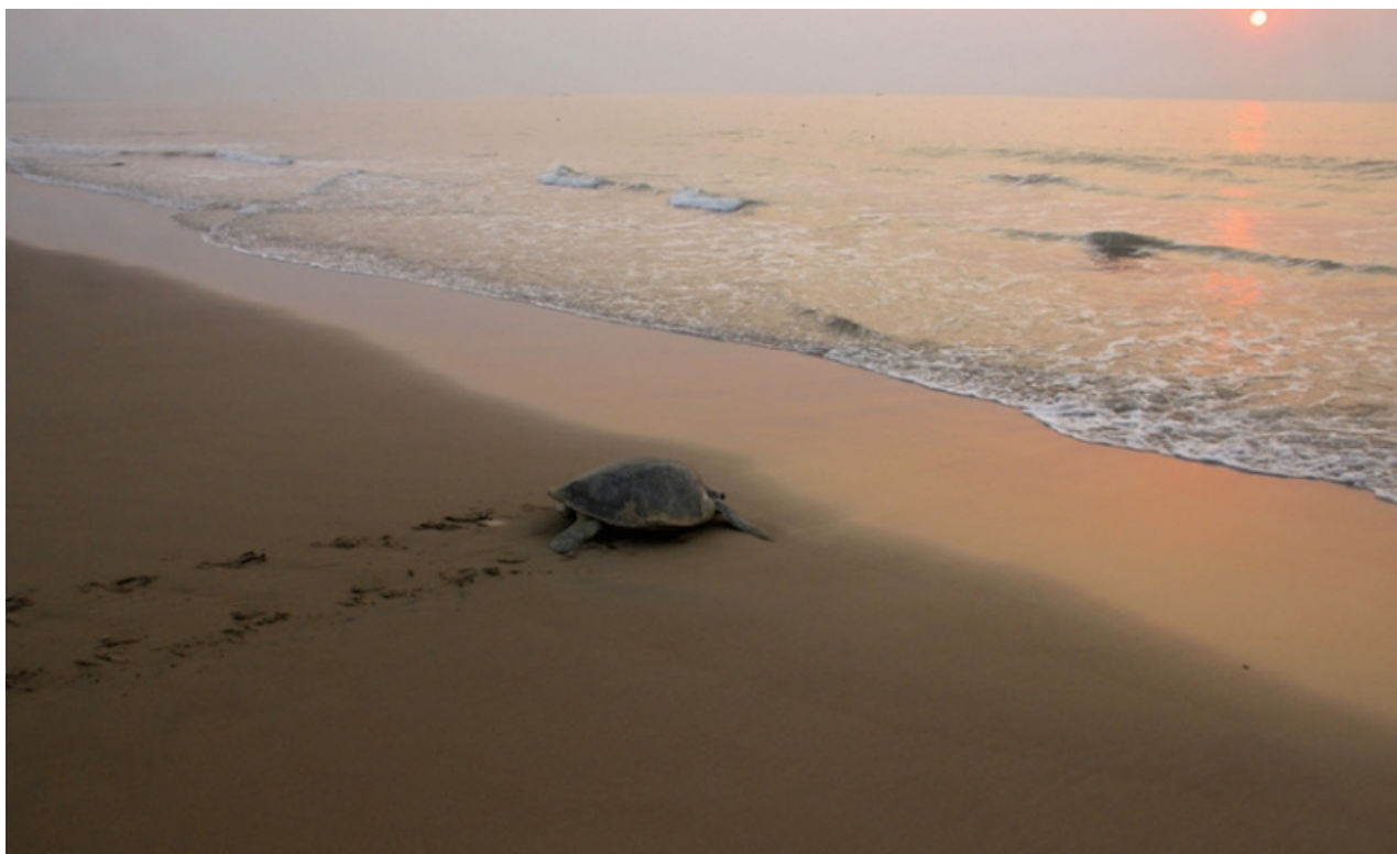
One of the most endangered species .