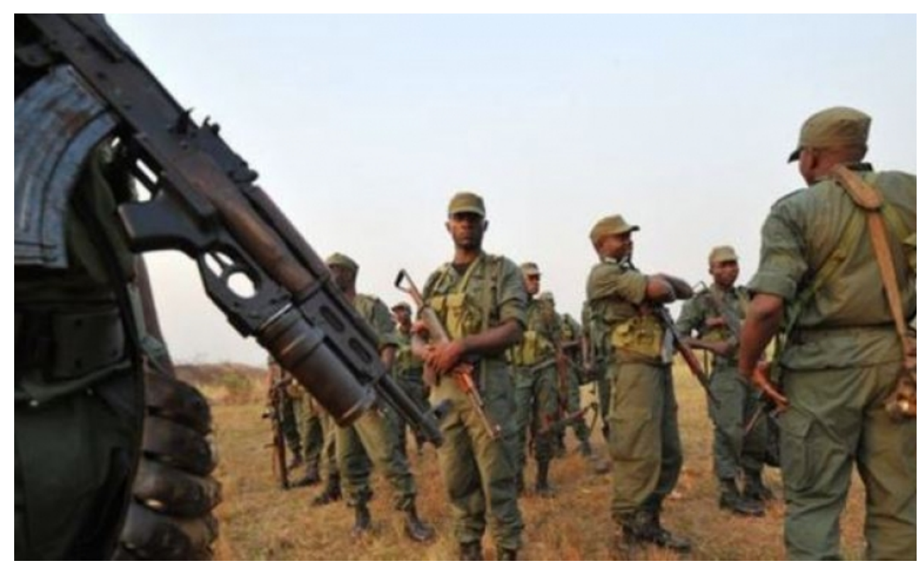
Nigerian soldiers in their fight against Boko Haram. Al accuses the army.