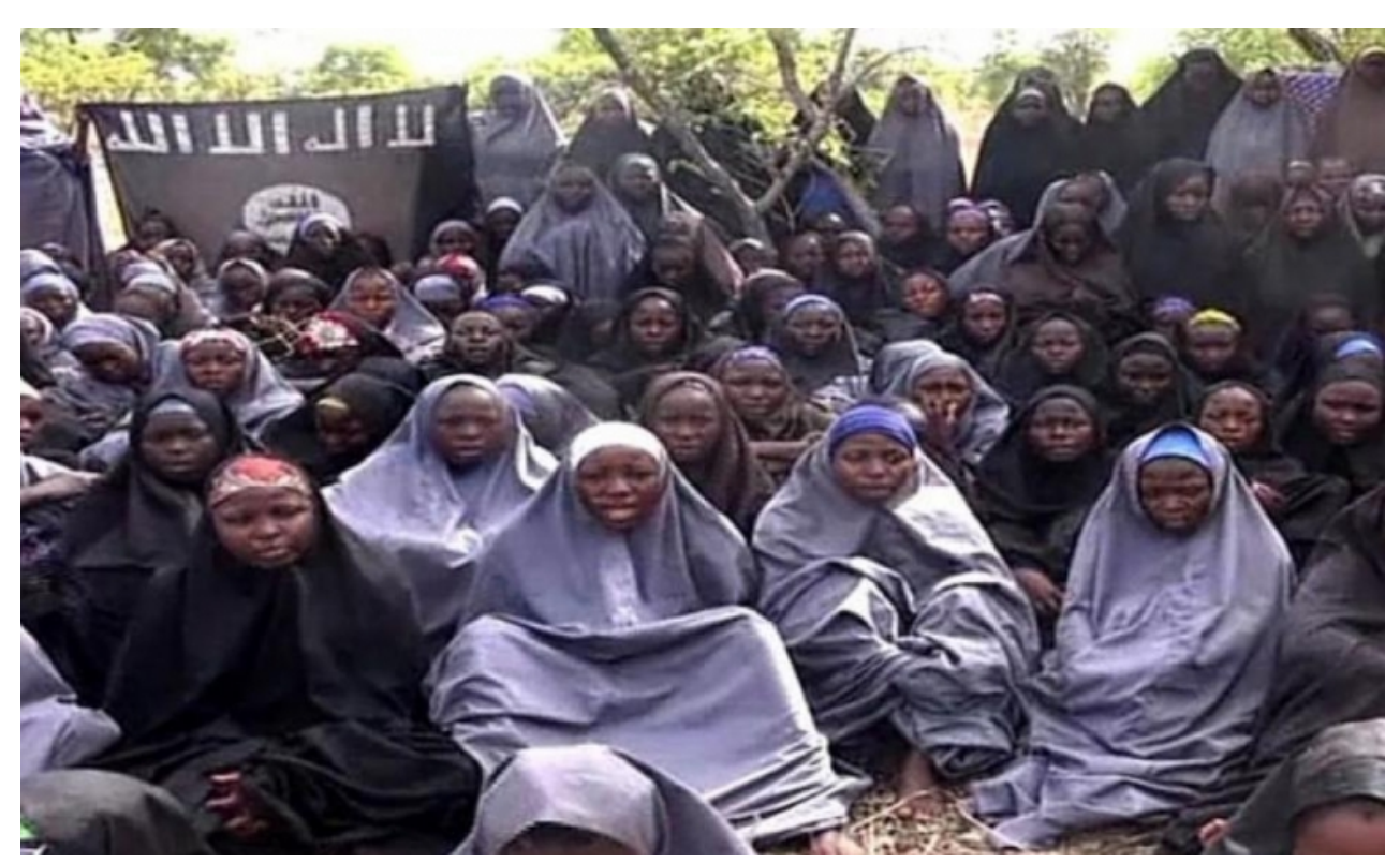
Boko Haram and the 110 girls kidnapped on March 2018.

Amnesty International denounces that the 276 girls kidnapped by Boko Haram in Chibok on 2014 have been sexually abused by their ' rescuers', mainly soldiers from the Nigerian Army. Last March, 110 more schoolgirls were abducted .