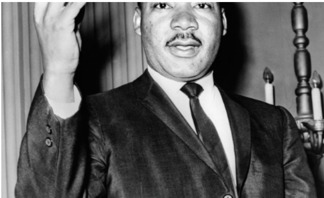
Martin Luther King was awarded the Nobel Peace Prize in 1964.

The world celebrates the 90th anniversary of the birth of the famous activist who, despite his death in 1968, continues to inspire humanity with his speeches.